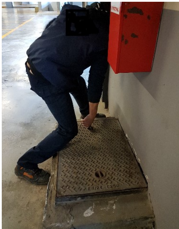
Unsafe lifting technique that could cause back problems

All rights for the pictures contained in this bulletin are protected