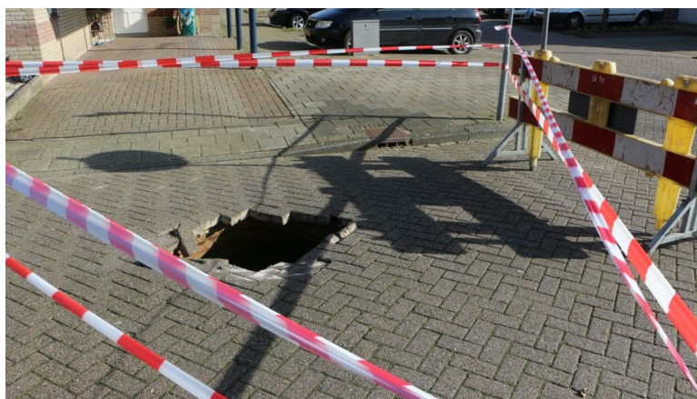
Insufficient barricading during paving maintenance works.